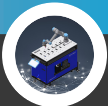
COBOT TIG WELDING