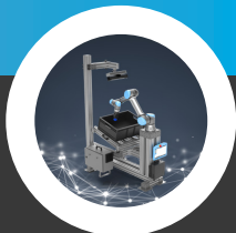
BIN PICKING/ MACHINE TENDING